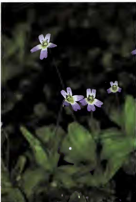
Figure 4. P. crystallina subsp. hirtiflora from Botanical Garden of Calabria University in full anthesis, general view.